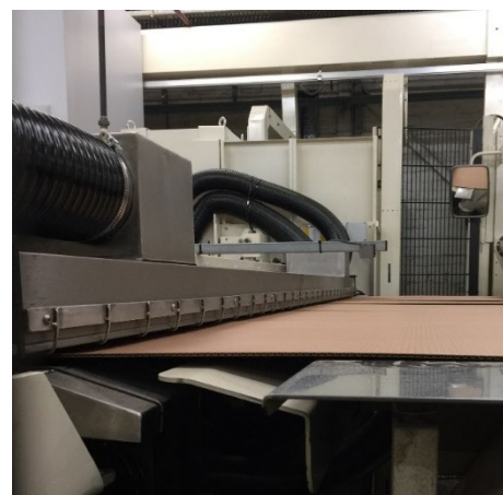
Infeed arrangement and grids

KELVA HEAD OFFICE – SALES SWEDEN Bryggaregatan 23 SE-227 36 Lund T +46 46 16 07 00 kelva@kelva.com