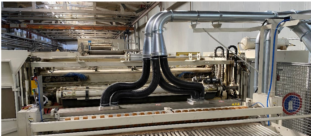
ST85CC installation at slitter/ scorer position