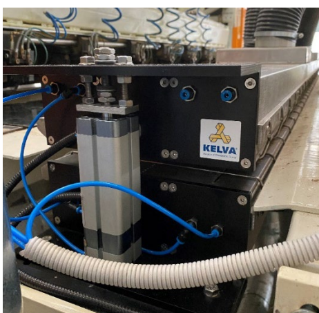
Gap adjustment, multistep cylinder